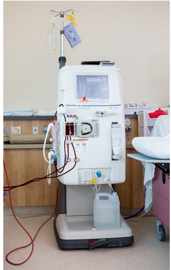
Clinical dialysis machine

The equipment also must contain comprehensive self-test and fault-indication capabilities, which require additional circuitry and the use of components that include self-test features.